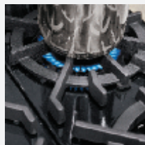
Dual brass burner.

Accessories are available through your authorized Wolf dealer. For local dealer information, visit the find a showroom section of our website, wolfappliance.com .