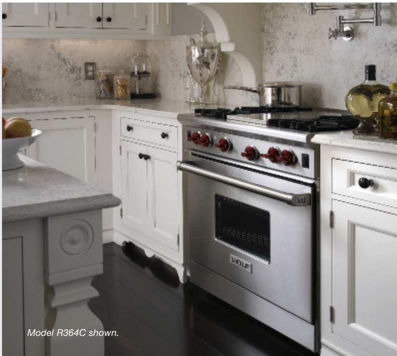
Model R364C shown.

Wolf has perfected the form, function and sheer durability of our gas ranges. Wolf gas ranges offer standard features such as an infrared oven broiler, convection baking, dual brass surface burners and our signature large red control knobs. Optional infrared charbroiler and infrared griddle give you the freedom to customize your gas range. Wolf gas ranges are available in natural or LP gas.