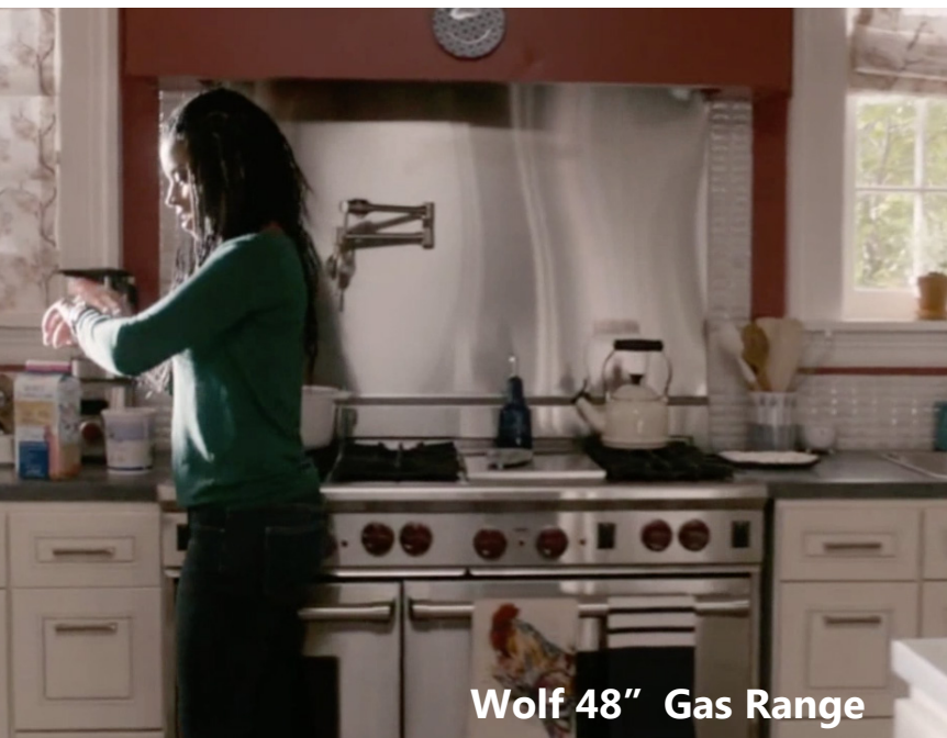
Wolf 48" Gas Range

The Wolf 48" Gas Range has performance features born of professional kitchens, for the precise control to master any type of cooking.