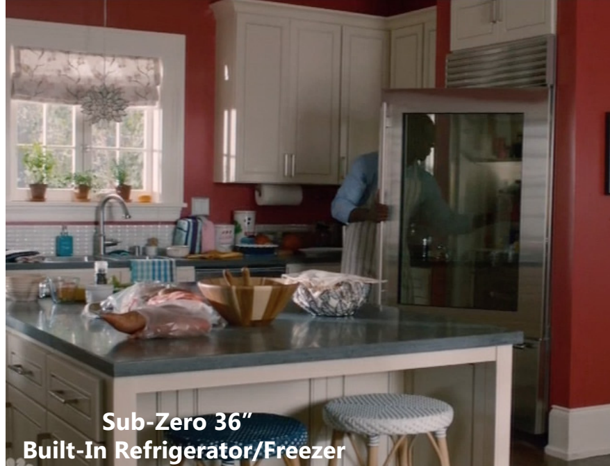
Sub-Zero 36" Built-In Refrigerator/Freezer