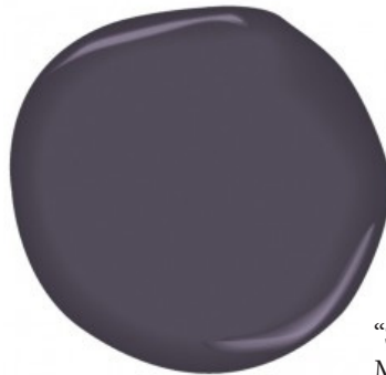
“Shadow 2117-30” by Benjamin Moore