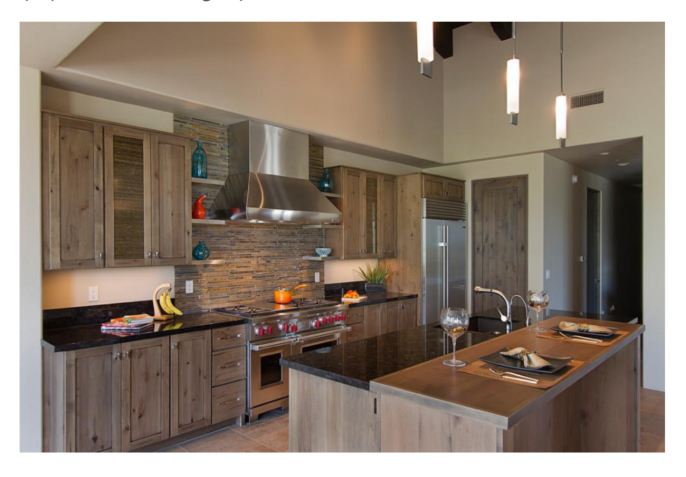
Tran•si•tion•al [adj.] 1. Marriage of traditional and contemporary, equating to a classic, timeless design

Some call transitional style a lighter traditional, but that's not accurate. Transitional isn't just lightening up an old favorite; it's about incorporating neutrals and making a nod to another popular decorating style.