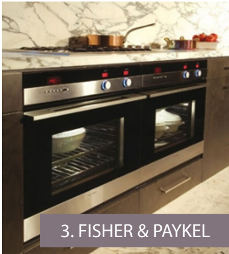
3. FISHER & PAYKEL